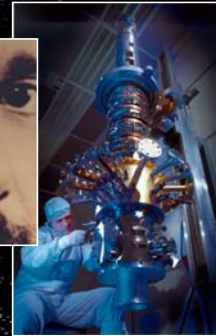
Probe during assembly