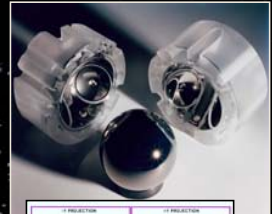
Gyroscope and housing